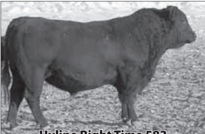
Hyline Right Time 583

Patriot has made a big impact on our program. Although there are only a few sons in the sale, there are many Grandsons. Look to see Lot #14, a very impressive direct son.