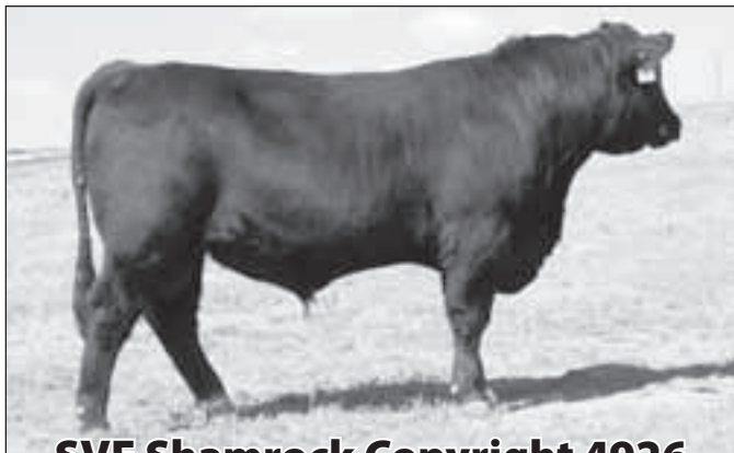
SVF Shamrock Copyright 4926

Mytty In Focus is the nation's leading calving ease to growth sire. His females are easy fleshing and make great momma cows.