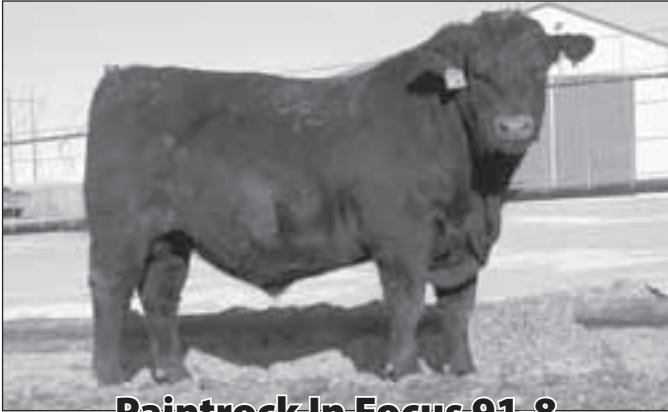
Paintrock In Focus 91-8

Reference Sire PAINTROCK IN FOCUS 91-8 calved - 1/31/08 bull • 16149673 tattoo 91-8 S A F FOCUS OF ER # MYTTY IN FOCUS # MYTTY COUNTESS 906 3210 RIGHT TIME 802 KATE OF PAINTROCK 437-6 KATE OF PAINTROCK 3214