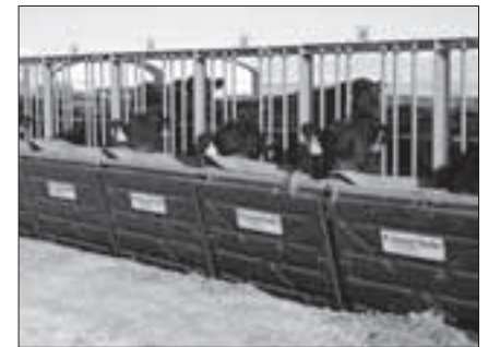
Our GrowSafe Feed Efficiency Testing System, one of the only owned by a purebred breeder in the U.S.

More efficient animals will not only save you money on the ranch ($60-70 per cow/year or more), but will also demand a premium when sold. Do the math; If a 5-6 weight calf is 30% more efficient? It will equate to $117/head bigger profit at the feedlot with today's costs. Or, 23.4 cents per pound more they can pay for your calves.