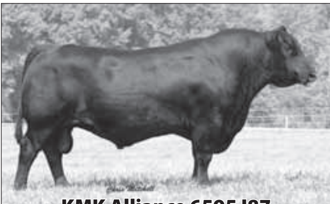
KMK Alliance 6595 187

583 is one of the most complete sires we have ever used. He works on heifers or cows. His daughters are extremely easy fleshing with absolutely perfect udders. His offspring PAP test as good as any we have used. Lucky 7 owned