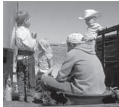
Stopping for a cold one!