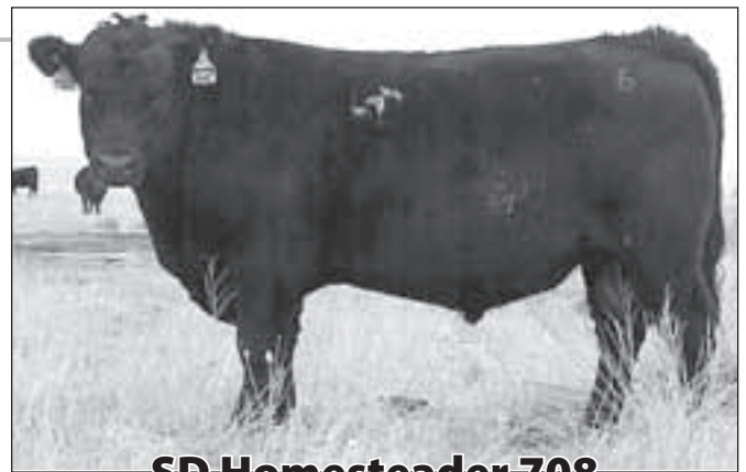
SD Homesteader 708

This bull is one of the most feed efficient bulls to ever go through the Midland Bull Test system. He had a RFI of -7.97. His paternal brothers, as a sire group shattered all records, 5 bulls with a combined average of -3.06 RFI and an average ratio of 113. He is good footed, travels well, and gained weight while breeding a lot of heifers as a yearling. Combine that with his PAP score of 37 at 7160' and you can see why we are so excited about him.