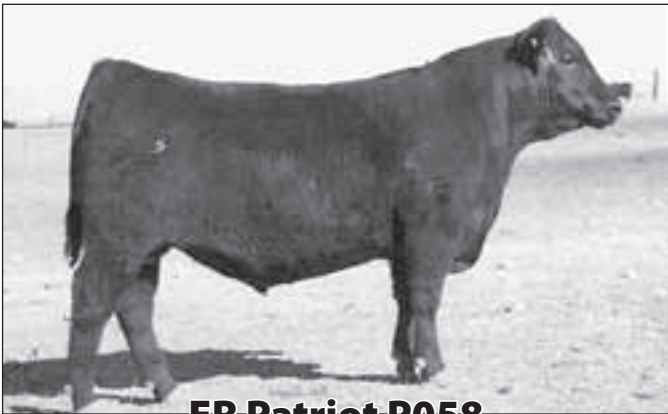
ER Patriot P058

91-8 was purchased as one of the gain leaders at Midland Bull Test. His offspring are easy to look at, and topped Paintrock Angus sale in December. He will be a force to reckon with. Lucky 7 owned