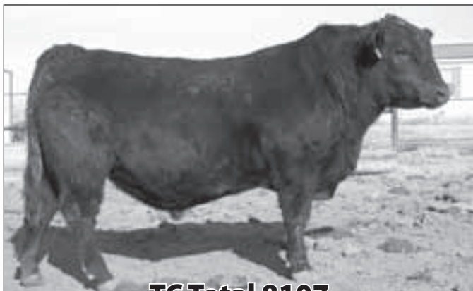
TC Total 8107

6050 does everything it takes to make cattlemen money. He has never taken a lame step and breeds all season long. A very moderate easy fleshing bull that will produce daughters that can milk. PAPs very good. Lucky 7 owned