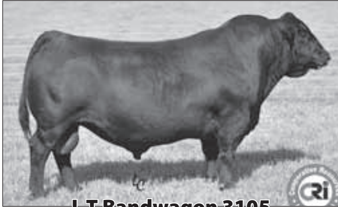
LT Bandwagon 3105