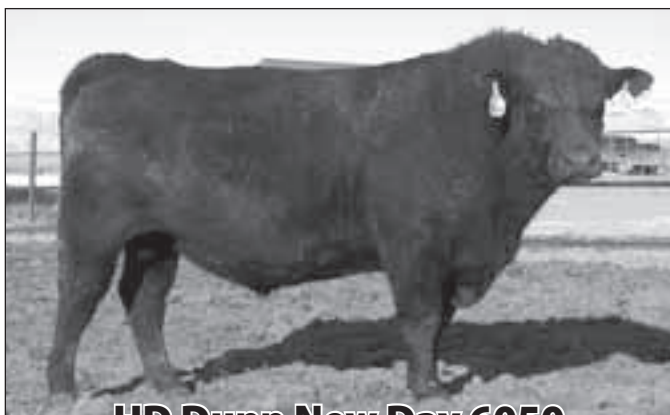
HD Dunn New Day 6050

Copyright is a very powerful, Low PAP producing sire. His offspring are very stylish with an extreme amount of performance and carcass. Lucky 7 owned