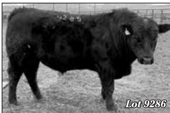
A son of Redland Rainmaker 3836