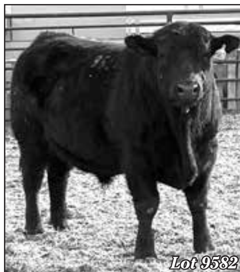
A son of Redbank Cincha 0264