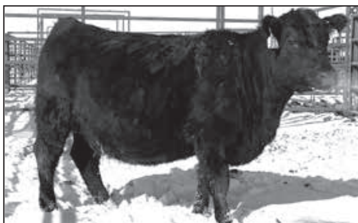
A daughter of McCumber 213 Fortunate 5120 The type of female we like to see. Deep, wide, feed efficient and excellent fleshing ability!